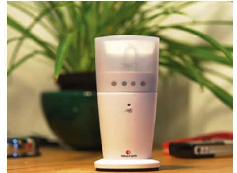
Flashing strobe light

Note - the smoke alarm still makes loud audible beeps to alert people without a hearing impairment.